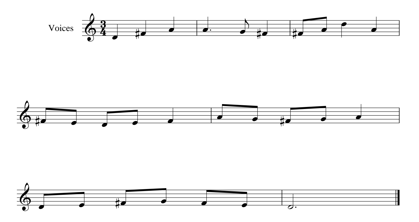
© Audrey Podmore, 2000 The Full Pitcher Music Resources www.fullpitcher.co.uk